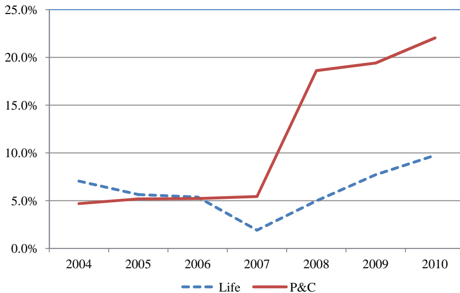
Figure 2: Fraction of ABS Positions Revalued at Year End This figure presents the number of ABS positions revalued to the market value as a percentage of all ABS positions across all life and P&C firms at the end of 2004-2010. We classify a position as revalued to the market value if the book or adjusted carrying value equals the fair value reported at year-end.